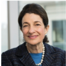
Olympia J. Snowe Chair and Chief Executive Officer Olympia Snowe, LLC Age 71