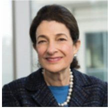
Olympia J. Snowe Chair and Chief Executive Officer Olympia Snowe, LLC Age 71