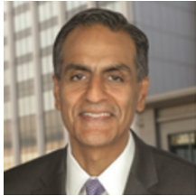
Richard R. Verma Vice Chairman and Partner The Asia Group Age 49